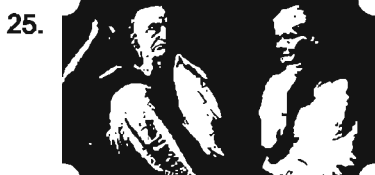
A Facebook Post

"When lights were turned off in an old-age home, two souls whispered in anxious tones; 'Our children - have they gone to bed?'"